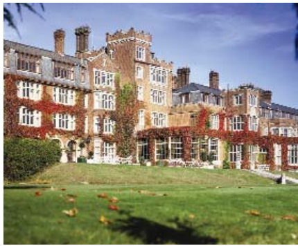
GUESTS' DELIGHT: Selsdon Park Hotel in South Croydon has an enviable reputation for service that it is teaching to hospitality students from Croydon College.