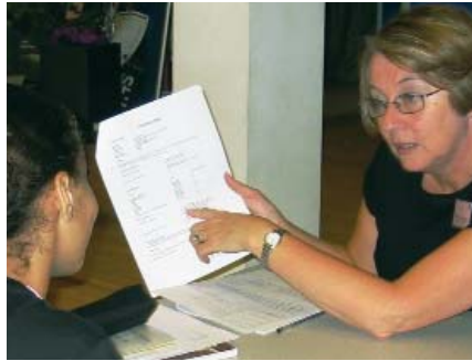
LOOK HERE: A volunteer interviewer offers all-important practical advice to a student.

CROYDON'S businesses play a crucial role in providing the interviewers needed to make these experiences as authentic as possible for young people.